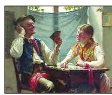
Old Man with Girl Playing Cards, oil on canvas Estimate: $600-900.

Las Vegas Exhibition Call Christie's for dates 1-212-636-2665