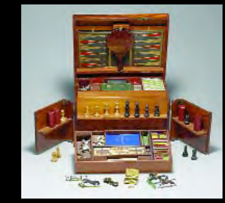
Exceptional Victorian Game Compendium, circa 1888, England, maker unknown. Estimate: $5,000-6,000