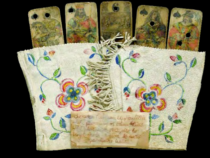
May Lillie Buckskin Cuffs and five Tarock Cards with Bullet Holes, 1912, Pawnee Bill's Wild West Show. Estimate: $1,000-1,200