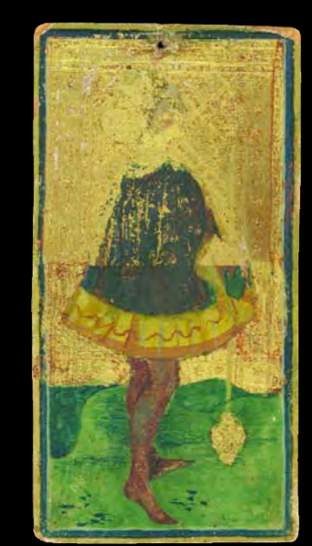
Visconti-Sforza, Male Page of Staves Tarocchi Card, Milan, circa 1450, attributed to Bonifacio Bembo. Estimate $10,000-15,000