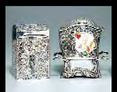
Sterling Silver Double Patience Card Boxes, domed top lid and palanquin. Estimate: $450-600 ea.