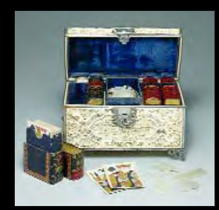
Tour-de-Force Ivory and Silver Export Playing Card Box, circa 1800, China, maker unknown. Estimate: $10,000-12,000